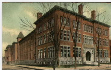
New Haven High School