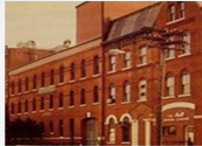
The Fresenius's Sons Brewery later to become The Hull Brewery