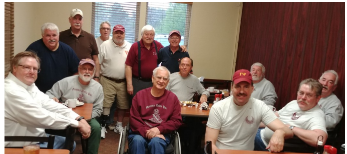
Anniversary breakfast in Colonial Heights April 13, 2019