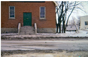
The Y-Knot Café on Albion Rd