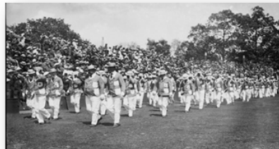
Yale class of 1884 reunion parade