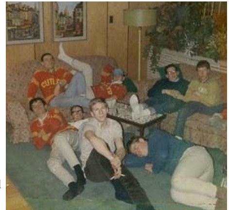
Gamma Alpha Pledges December 1966