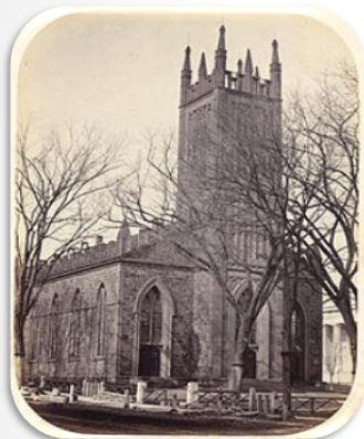
Trinity Church c. 1865, showing its original appearance