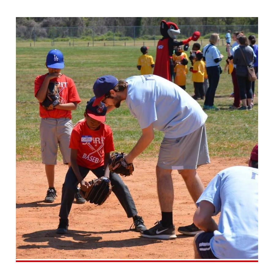
Gamma Psi Fraternity members provide field instruction